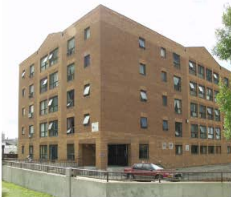
970 Sherbrook Before window replacement

There is a demand for housing at Sir Paul Martin Estates for both the senior and family wings.