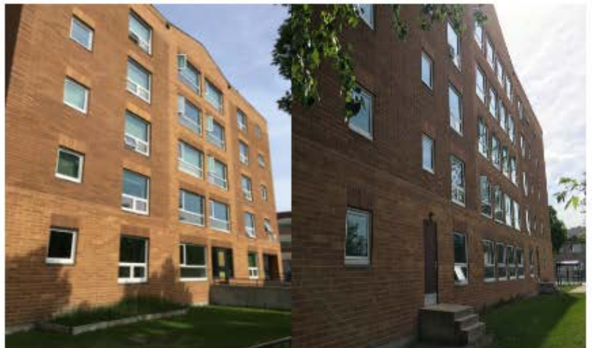
970 Sherbrook After window replacement