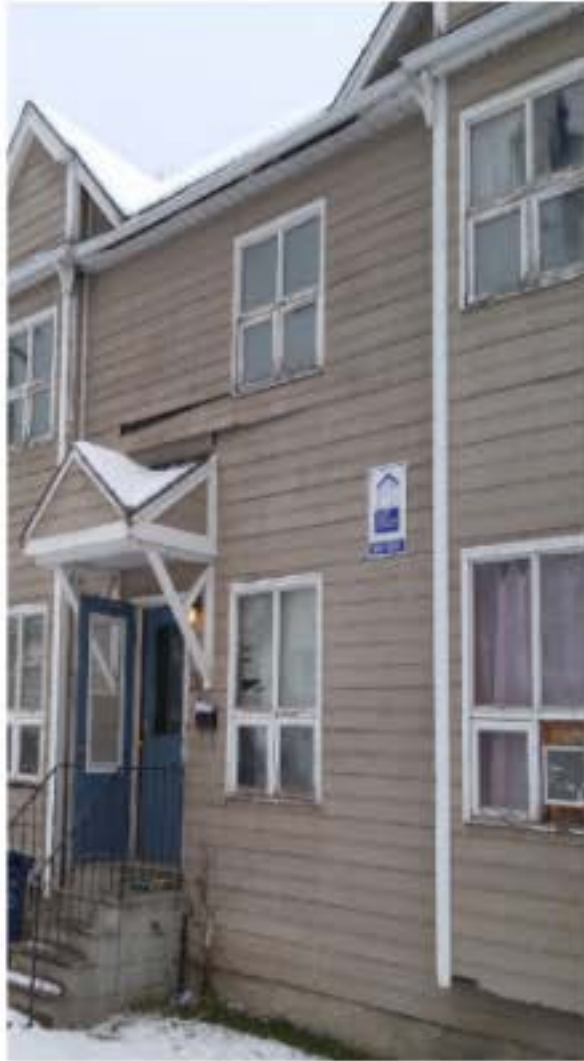
266-268 Laura Before renovation