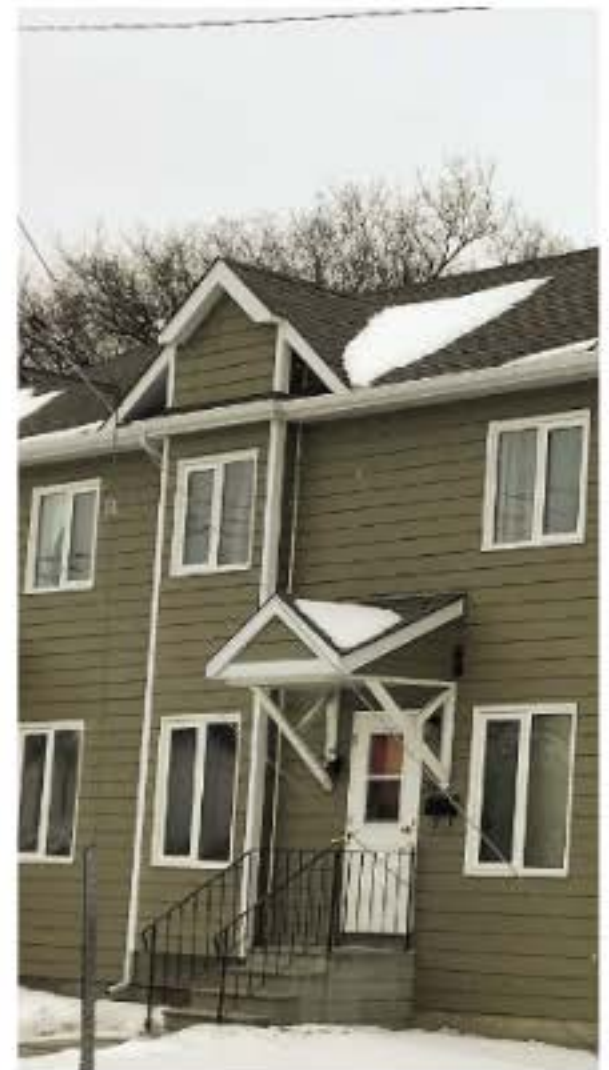
266-268 Laura After renovation

2 million of project funding provided by CMHC and Manitoba Housing (Social Infrastructure Funding)