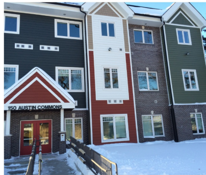
150 Austin Street