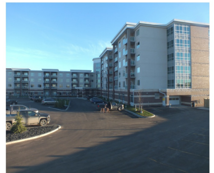
440 Chrislind Street

Of note are the increased number of refugees and immigrants requiring housing in Winnipeg. Winnipeg Housing has been able to offer housing to many newcomers to Canada this year. The increased number of families requiring housing in Winnipeg will likely continue to grow in the upcoming.