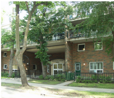
50 Roslyn Street

Many outside agencies regularly approach property management staff to seek appropriate housing for their clients. These agencies offer ongoing long-term support to their clients once they have been approved and received accommodations with Winnipeg Housing. Once housed, the partnership with ongoing support services has proven to be beneficial to both the individuals supported by these agencies and to Winnipeg Housing. This has been especially valuable for successful tenancies for those facing homelessness otherwise.