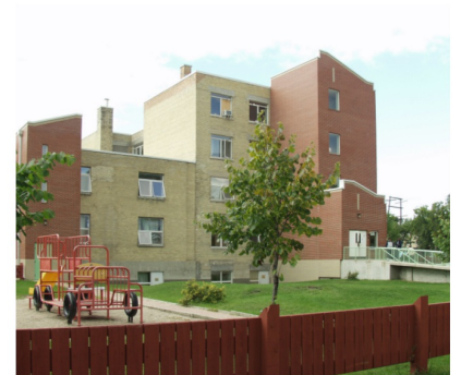
60 Frances Street