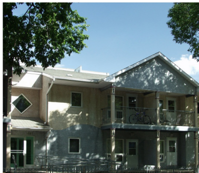
407 Langside Street